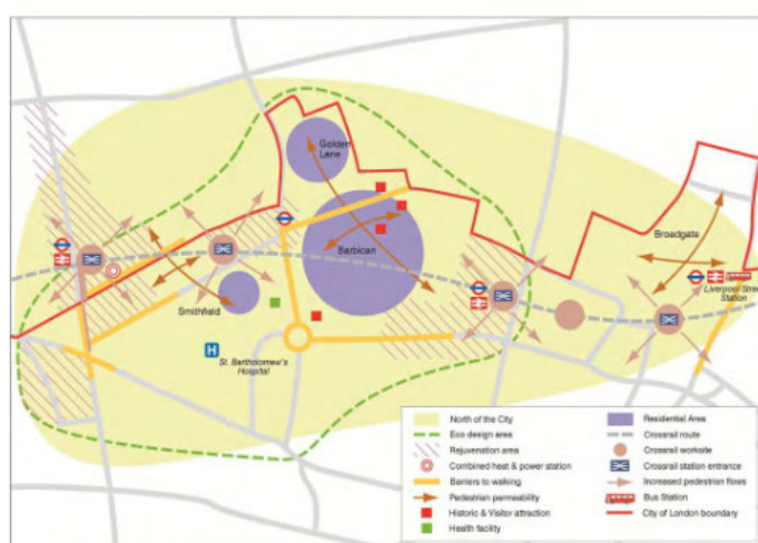
FIGURE 8: THE NORTH OF THE CITY

In this Area residential, business, heritage and cultural interests come together within a highly populated footprint. Population density will increase with further residential development, and with is a need to consider supportive social and educational facilities. The purpose of this application is to bring a neighbourhood dimension to local planning in this area, given its crowded nature and the impact of development on the economic, social and environmental well-being of existing residents and businesses.